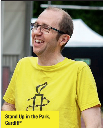
Stand Up in the Park, Cardiff*