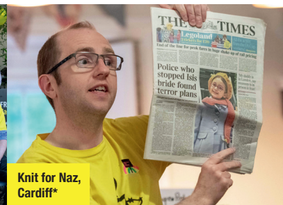
Knit for Naz, Cardiff*

*images courtesy of Natasha Hirst Photography