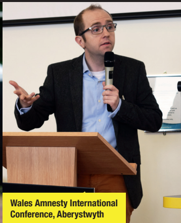
Wales Amnesty International Conference, Aberystwyth